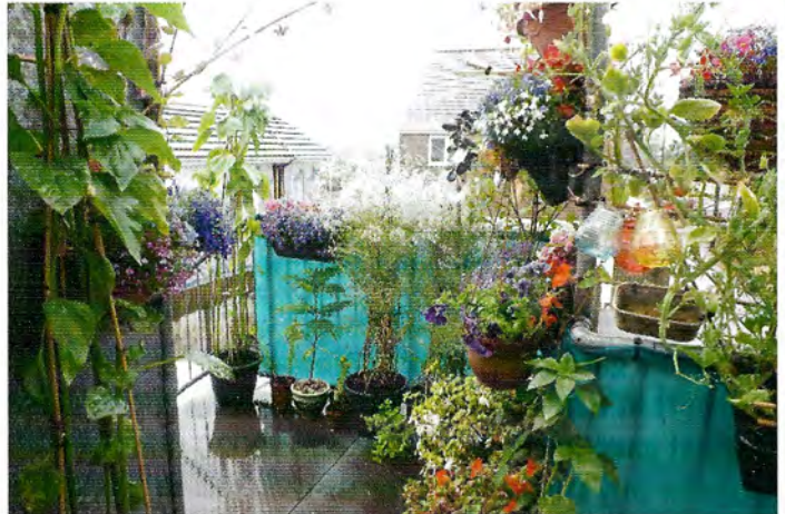
Graham Croydon – 2nd place Small Garden