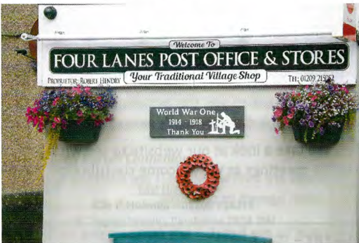
Trevor Dungey – 2 nd place Large Garden