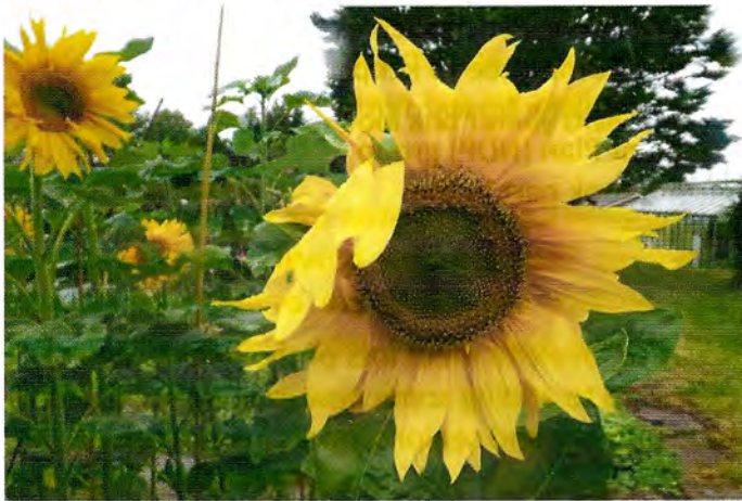
Sunflowers from Pool Academy

Please enjoy the images below from a selection of winning entries!