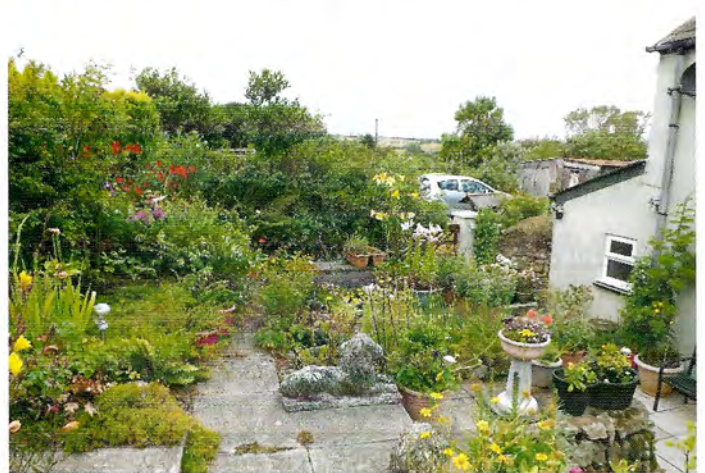
Four Lanes Garden Club – 1 st place Community Display