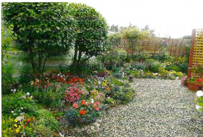
Irene Buckingham – 1 st place Medium Garden