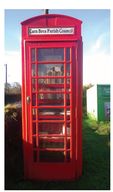
Mini library at Countryman Inn

If you have any books that you would like to donate to us we will happily take them and use them as space becomes available. We can collect if it helps you. Ring or email us, please.