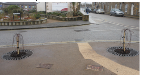
Station Road, Pool