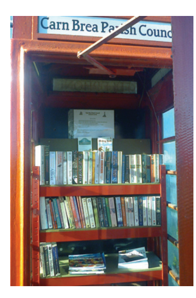
Ready to borrow

Looking ahead we would be interested to hear your thoughts about where else in the Parish we might create another Book Share. Please let us know if you have a good idea and we will see what can be done.