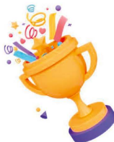
Marise Levenson Memorial Award