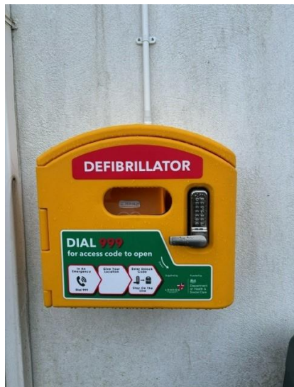
Co-Op Food St Higher Broad Lane

The Council also partnered with London Hearts to provide a 3 rd unit which was match funded by London Hearts reducing the cost to the Council, and the unit was installed at the Co-Op Food Store on Higher Broad Lane in January 2024, and a huge thank you to the Manager of the store for his tireless efforts in supporting the installation.