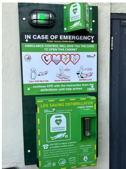
The Sportsman's Arms Pencoys