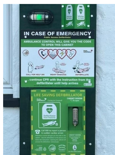
The Countryman Inn Piece