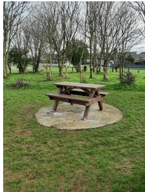
New Bench at Moorfield Road Open Space.