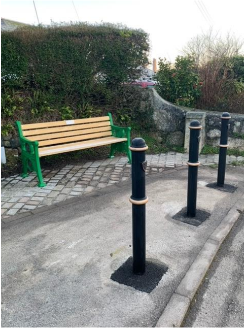
Fixed Bench and Installation of Bollards at Carnkie.