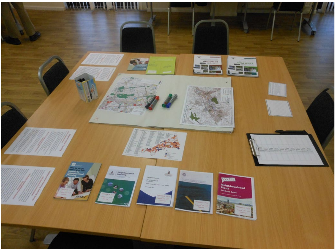
Photo 1 & 2 'drop-in' Session format.