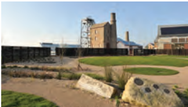
Engine House from Gardens

Come along on Friday 20th April to join the Hearty Party Parade and