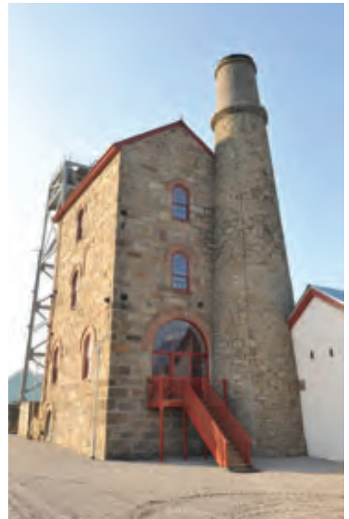
Engine House from Childrens Playground

*Workshops and activities may include a nominal fee, please check www.heartlandscornwall.com for details nearer the time, or pick up a Heartlands Daily Events Sheet on the day.